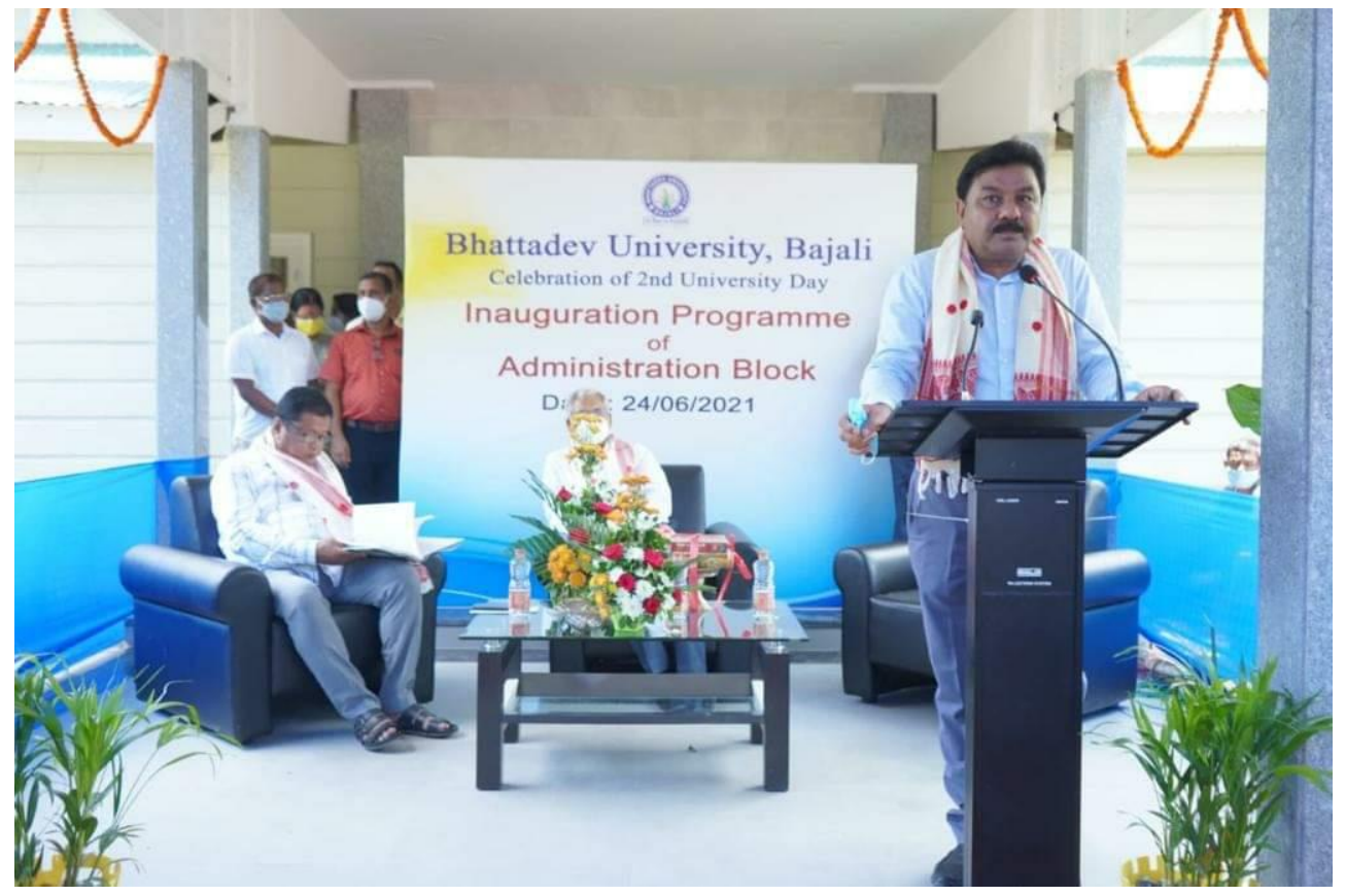
Inauguration of Administration Block by Dr. Ranoj Pegu, Hon'ble Education Minister, Govt. of Assam